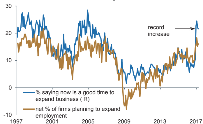
Figure 3: National Federation of Independent Business (NFIB) Survey

Sources: IHS, National Federation of Independent Business, Euler Hermes